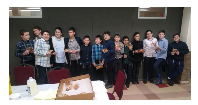
Pre-Shacharis Mishnayos Chaburah Siyum on Sotah

PLEASE SHARE WITH US! Please email any Mazel Tov information to reuvenreview@ohrreuven.com!