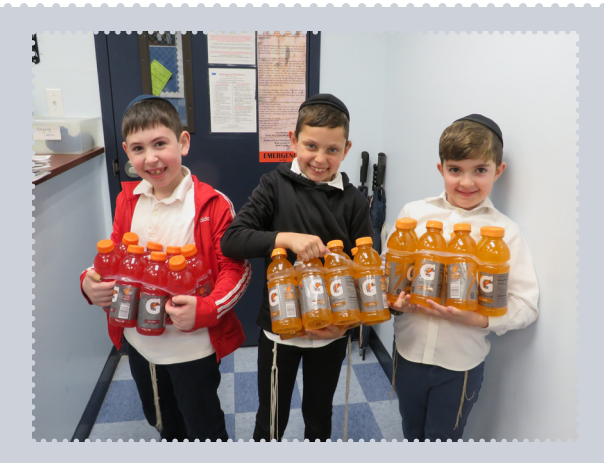
Thank you to the YK N'shei for sponsoring the Rosh Chodesh treat!