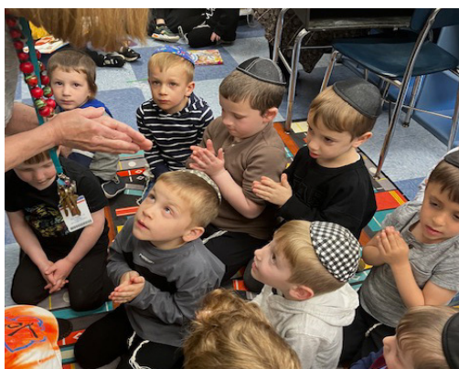
The Kindergarteners enjoying their library time!