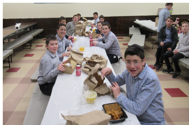
6th - 8th Grade Mishmar Siyum from Kosher Castle on the first 2 perakim of Maseches Megillah!

Reminder: It is the Yeshiva's policy that no home baked goods be brought in to be distributed to the talmidim.