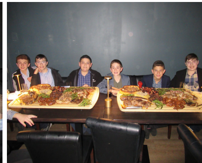
8th Grade trip to Fireside for raising 25 thousand dollars in the raffle campaign!