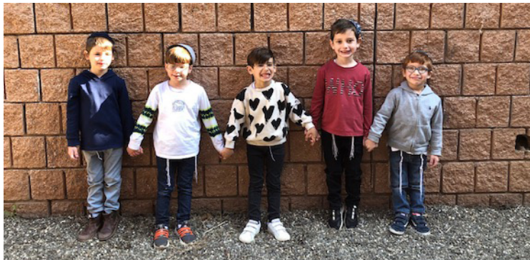
The Pre1a class learning about V'ahavta L'rayacha Kamocha during Sefrah