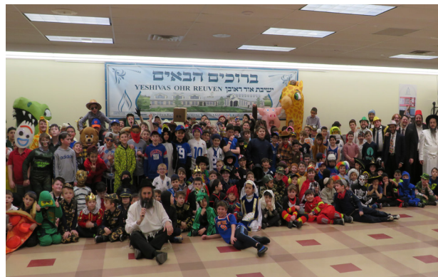
Yeshiva Ketana Pre-Purim Dress Up Day!