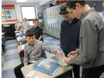
Boys giving Machatzis Hashekel