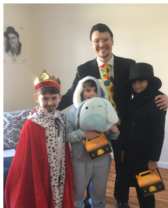
YK talmidim giving Mishloach Manos to their Rebbeim on Purim