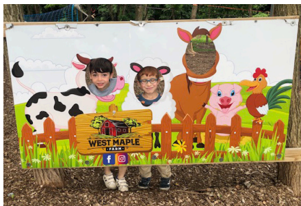
Pre1a on a trip to West Maple Farms