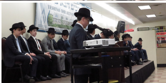
Mazal Tov 8th grade upon their Graduation!