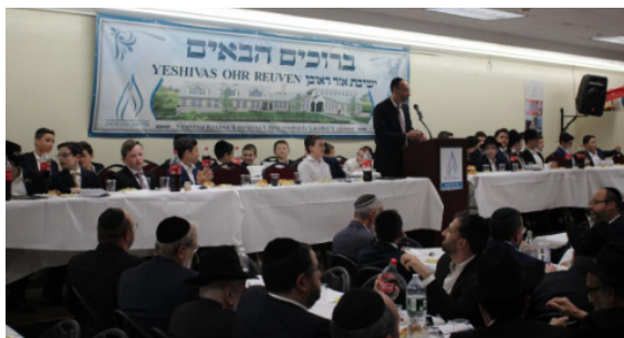
6th - 8th Graders at their Honors Dinner