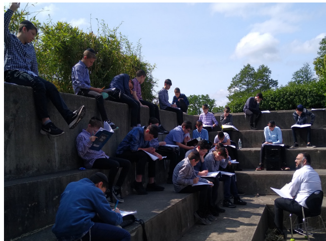
7th grade learning outside