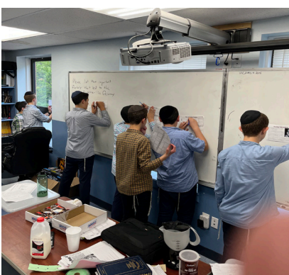
8th graders, in their last week of school, assiduously taking notes on the rise of dictators before World War II - Learning until the last day!!