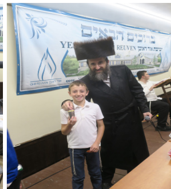
Grand finale on the last Friday of the Matnas Shabbos Program