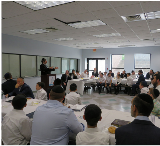
The Rosh Yeshiva speaking at the 6th grade Father-Son Breakfast Siyum