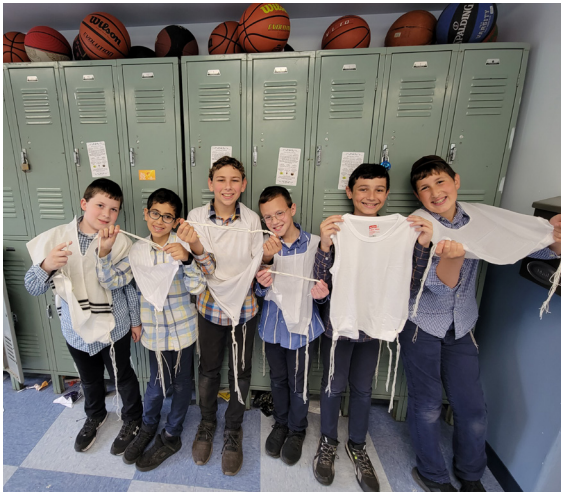
6th grade's tzitzis project