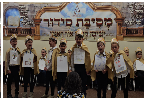
Mazal Tov to the Pre-1a on their siddur play!