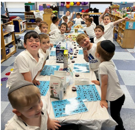
Kindergarten having a brachos party