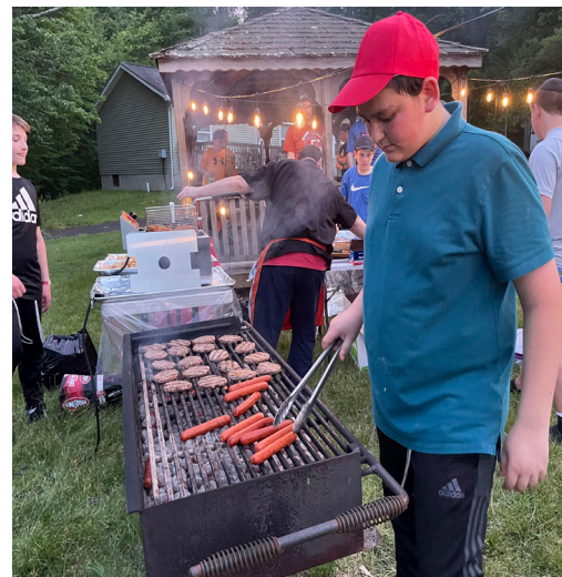
8th grade on their well deserved graduation trip