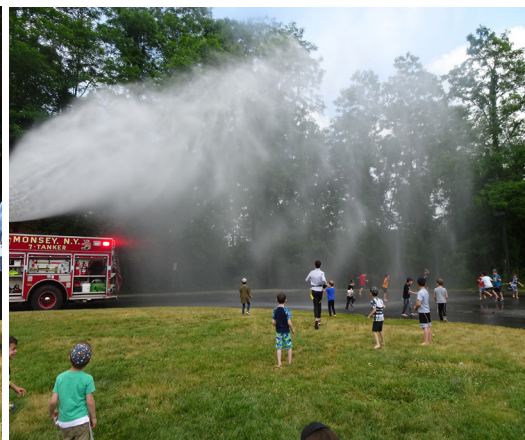
The Preia had a fire truck come visit!