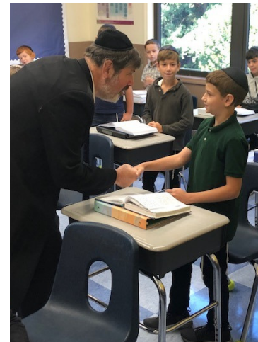
The Rosh Yeshiva greeting our Talmidim the first week of Yeshiva!