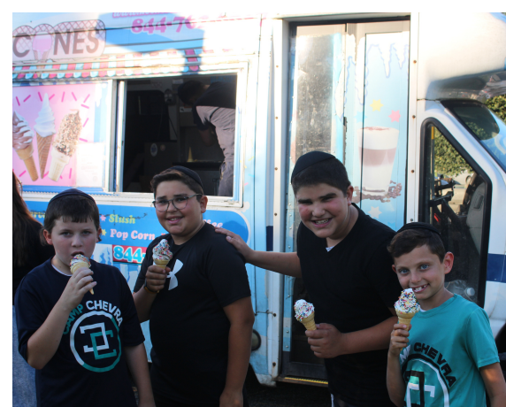
Nit Checking at Yeshiva Thank you to YK N'shei for the ice cream truck!