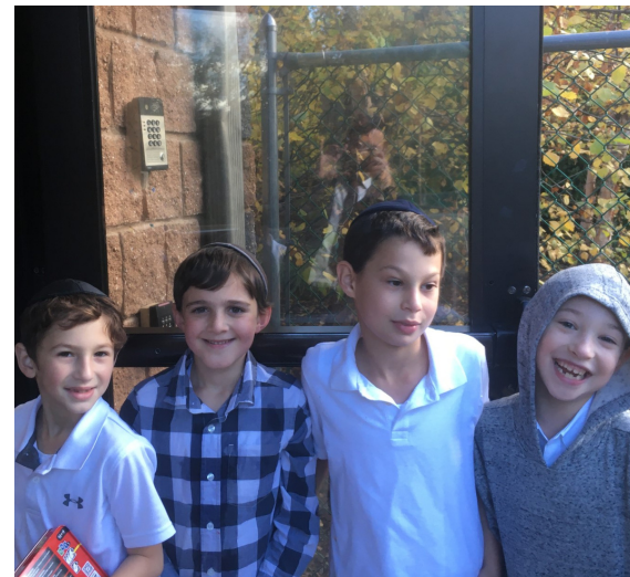
3rd & 4th grade doing TON by holding the door for others