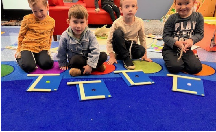
K1 learning the letter כ