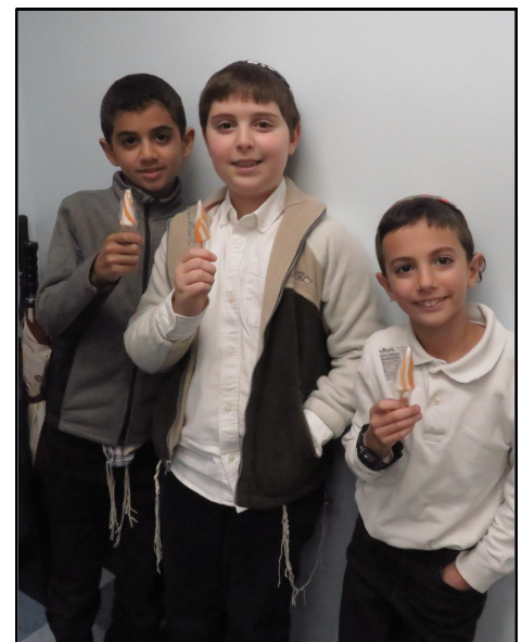
Thank you N'shei for sponsoring this months Rosh Chodesh treats!