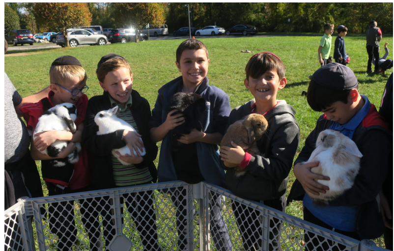
The YK talmidim enjoying the petting zoo for Parshas Noach!