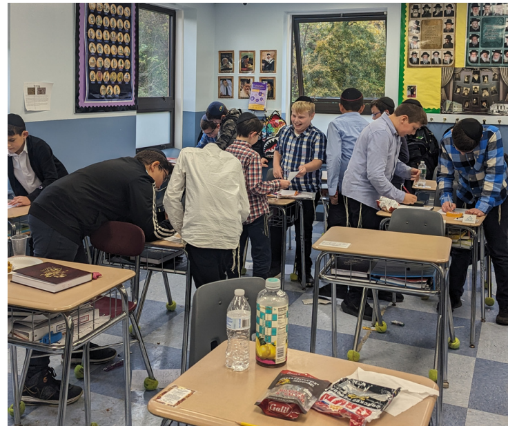
6th grade working on building stories collaboratively while practicing proper sentence structure.