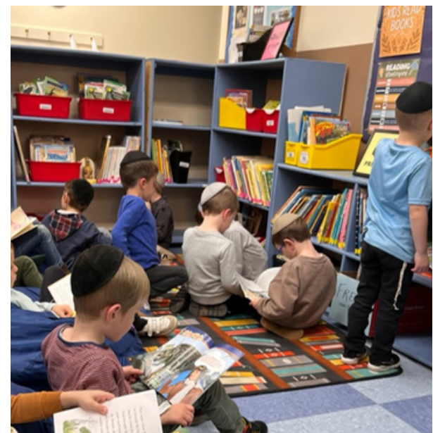
Pre-1a enjoying the library