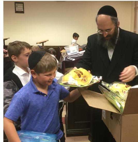
First week of the Matnas Shabbos program