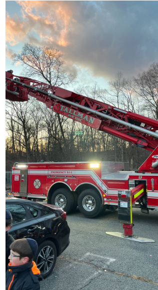
Fire safety at Ohr Reuven