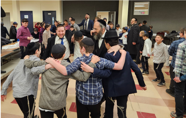
Dancing together with the Talmidim saved from the bus fire last week. after the neis of the bus חסדי ה' כי לא תמנו