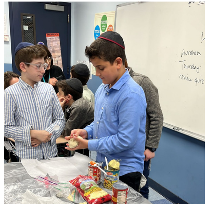
Sixth grade begins presenting their how-to/process paragraphs