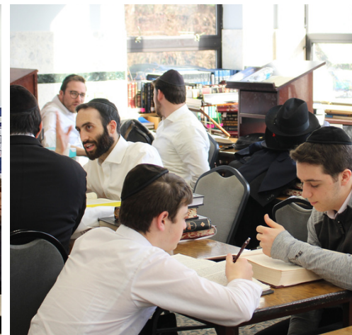
Shteiging in learning!

PLEASE CHECK THE LOST & FOUND FOR YOUR SON'S MISSING ITEMS!