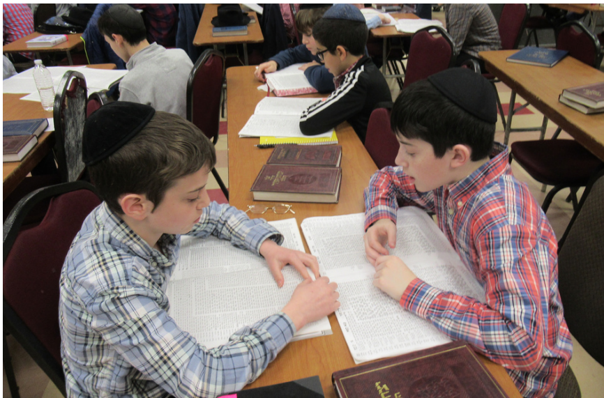
7th & 8th grade Daf Yomi Week