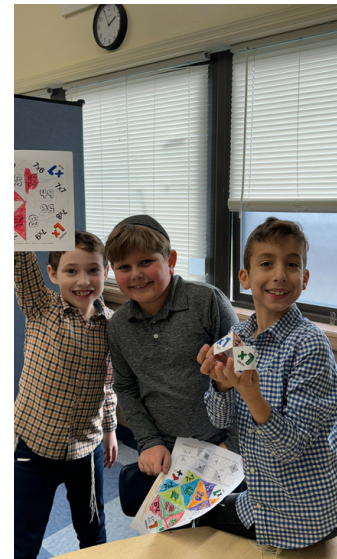
Miss Schwartz's math groups working on their multiplication skills using fun activities!