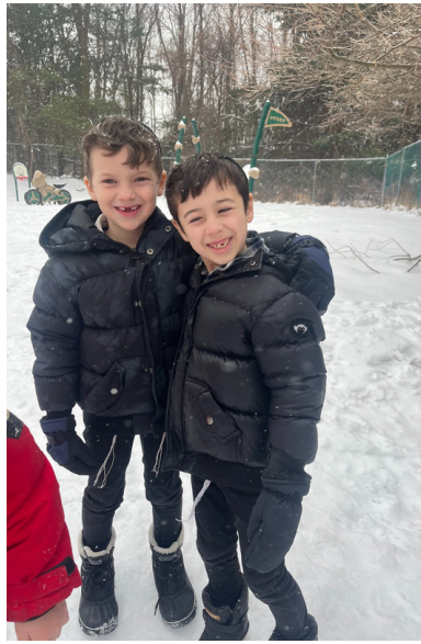
1st graders playing in the snow