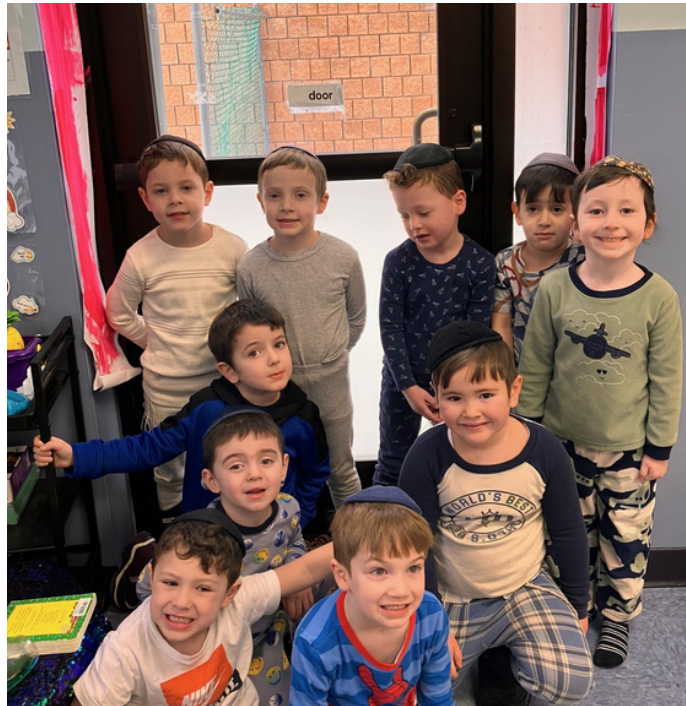
K1 protected from makas bechoros because of the blood on the doorposts