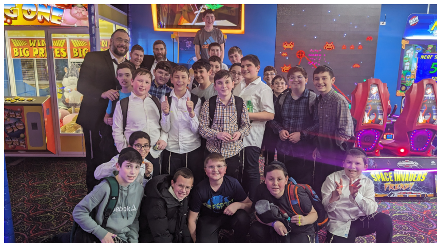
7th & 8th grade Kedusha Warriors, AKA technology awareness program, having a great time at BOUNCE, enjoying a trip as part of the many features of the program.