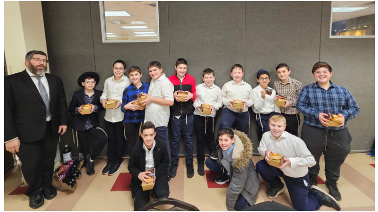
Breakfast special for siyumim on maseches sanhedrin and makkos , learning at the pre-shacharis Mishnayos program