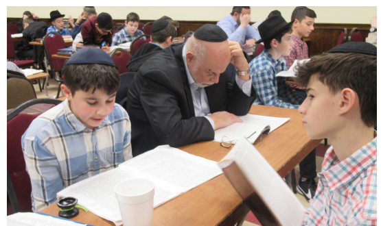
7th and 8th graders reviewing פרק הכונס on the same week that the daf yomi was doing the same perek