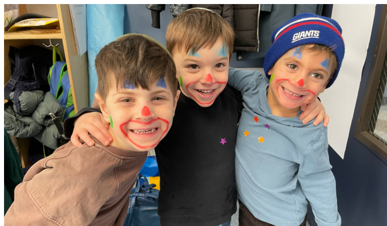
Morah Tova's Kindergarten class dressed as leitzanim (clowns) for lamed