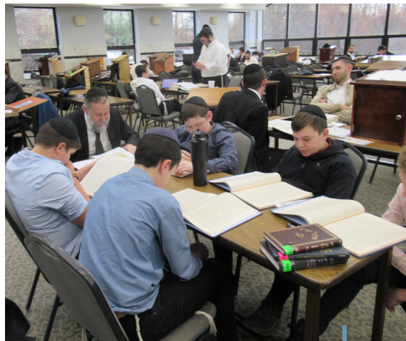
8th graders being farhered by local Rabbonim and Rabbeim