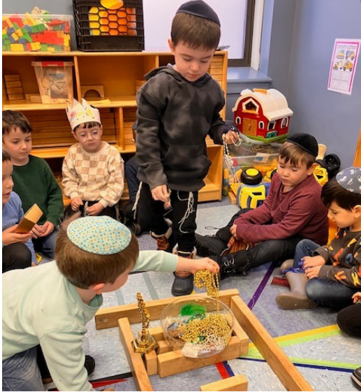
K1 displaying giving terumah to the mishkan