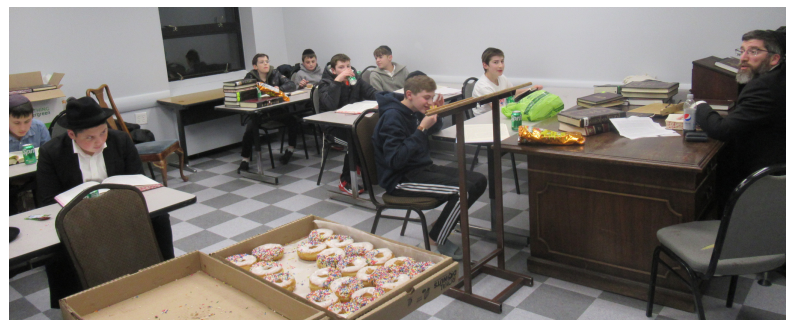
8th Grade Snow Day Voluntary Night seder