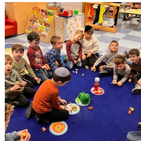
K1 learning hands on about the makos