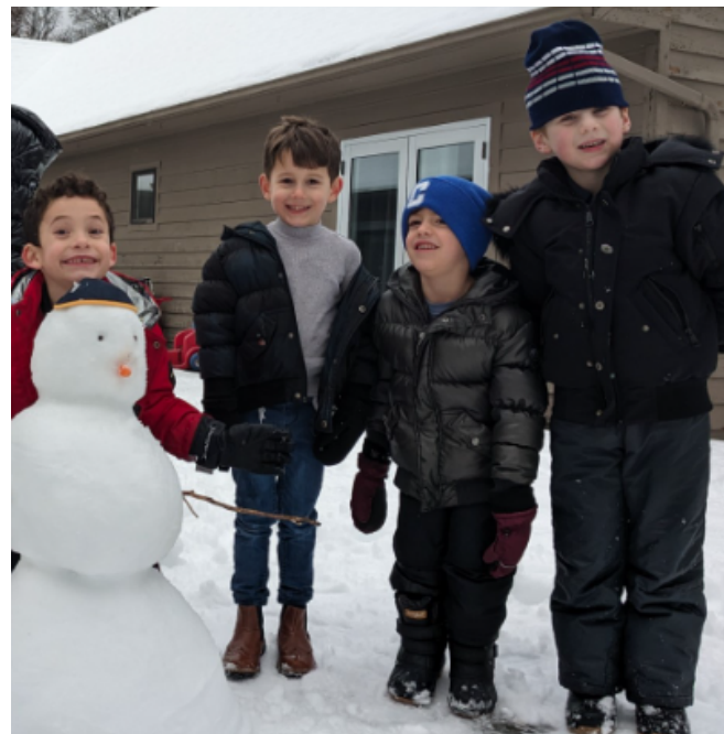
In the snow!