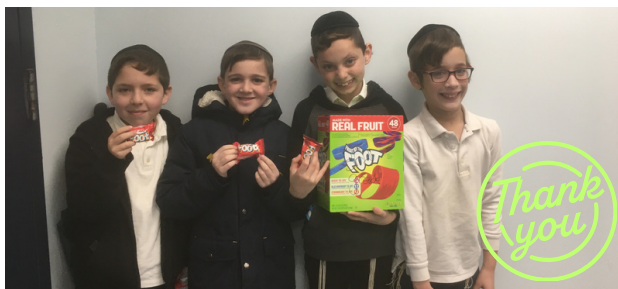
Thank you to the Nshei for the Rosh chodesh treats!