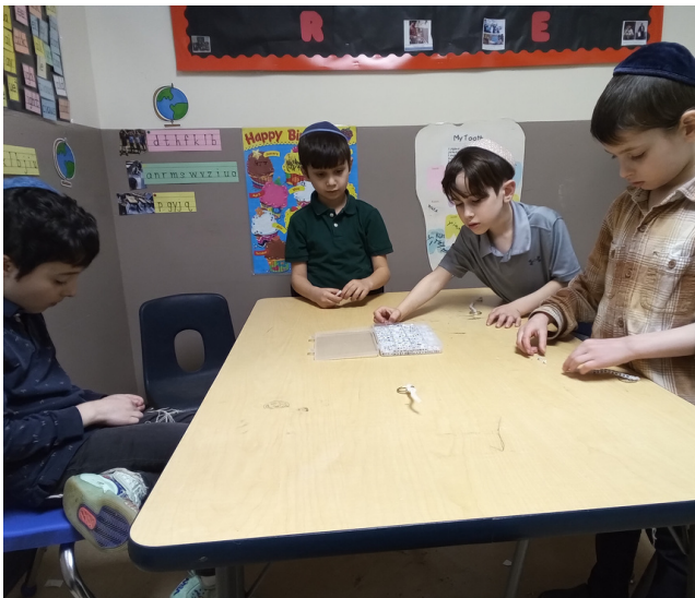
We had a celebration for finishing our large lowercase handwriting unit with personalized key chain and slurpees