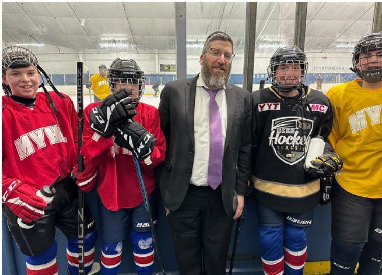
Rebbi Cheering On His Talmidim