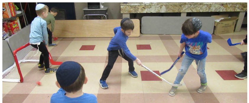
Enjoying the 8th Grtade Rosh Chodesh Adar Carnival!