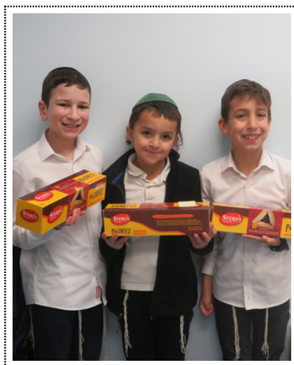
Thank you to the Nshei for the Rosh Chodesh treats!