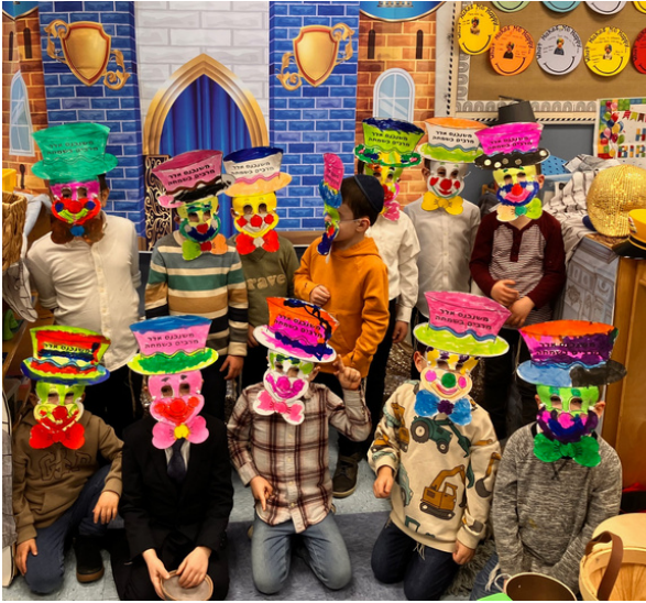
K1 on Rosh Chodesh Adar 🌟