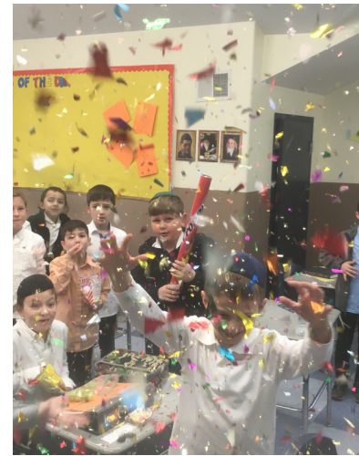
3rd grade celebrating Rosh Chodesh Adar with confetti Shtick