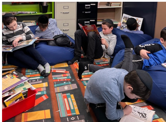
3rd grade enjoying our library