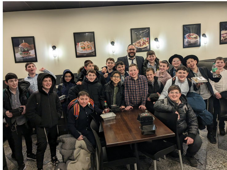
7th grade boys who reviewed Hachovel 25 times ( 175 daf chazarah!! ) went to KC Grill this past week

PLEASE SHARE WITH US! Please email any Mazel Tov information to reuvenreview@ohrreuven.com !