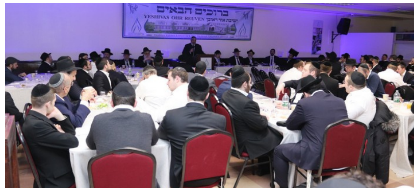
Alumni Melava Malka