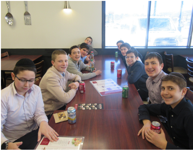
8th grade trip to Kosher Castle for the Chumash honors siyum on ספר בראשית