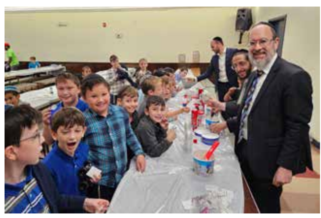
Kriah Knockers ice cream reward!