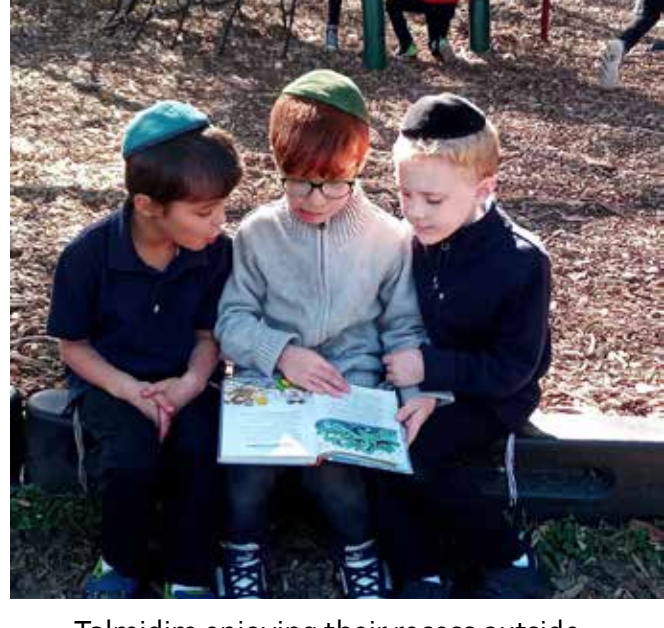
Talmidim enjoying their recess outside