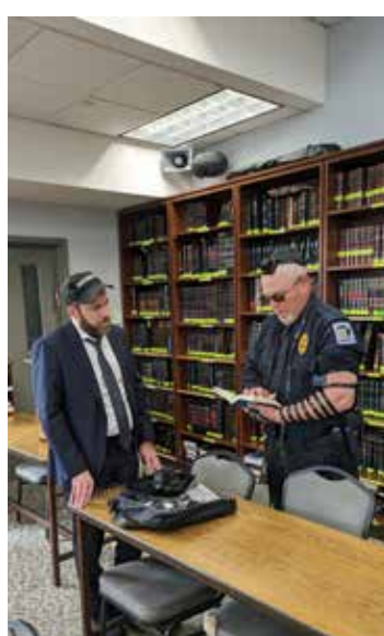
The real security!