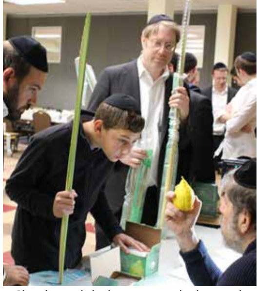
Checking daled minim with the Rosh HaYeshiva at the mechira