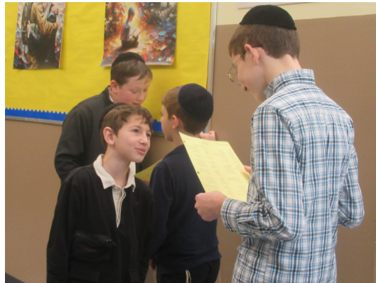
8th Graders Helping The 4th Graders Memorize Az Yashir

Vol. 12 Issue #17 January 17, 2025 4:37 PM י"ז טבת תשפ"ה פרשת שמות