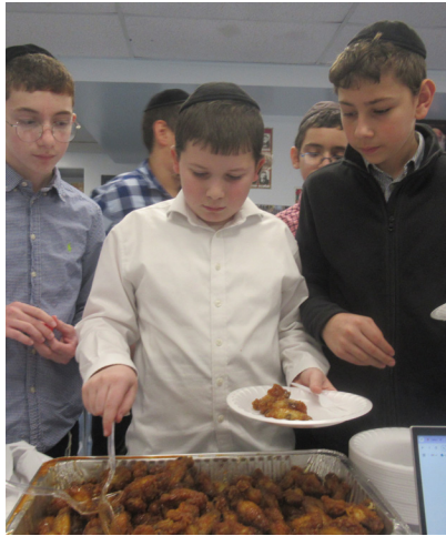
8th Grade Siyum on maseches beitza celebrating an above 100 average on the full masechta final