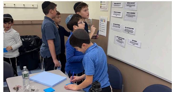
5th grade boys deciding what Upstander strategy they could use to change a negative scenario.