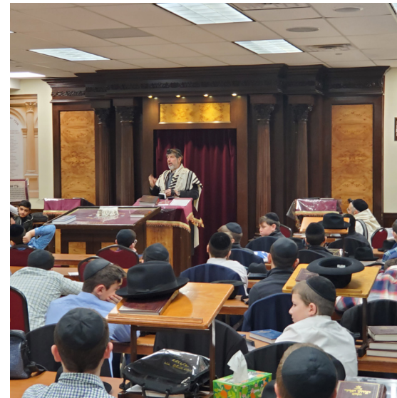
The Rosh HaYeshiva speaking to our middle school minyan after shacharis