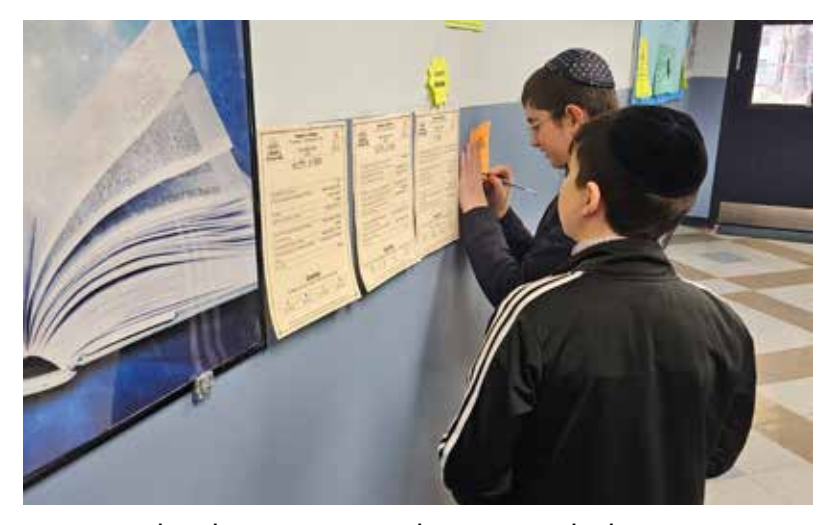
Talmidim review Mishnayos with the new Master-A-Mishna program