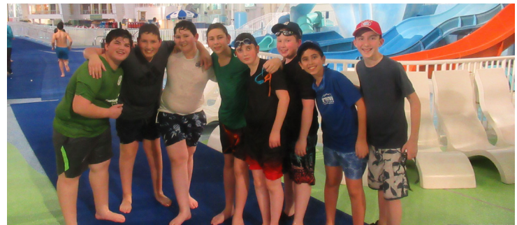
8th grade davening program trip to American Dream Waterpark