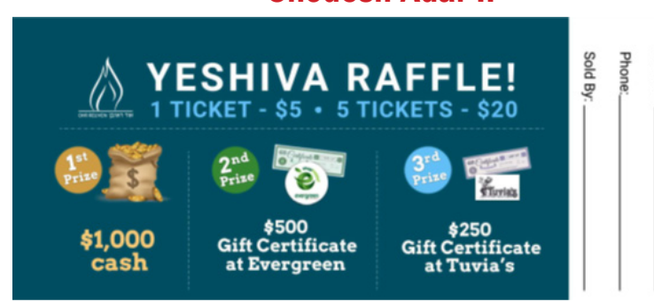
As in past years, Yeshiva K'tana Ohr Reuven's 14th annual raffle campaign will begin on Rosh Choder Adar 5785!

This year the boys can look forward once again to fantastic prizes as well as amazing class prizes! Each class will have the opportunity to experience everything from pizza parties to exciting class trips. As Purim approaches we want each and every Talmid to do their best collecting on behalf of the Yeshiva and make a Kiddush Hashem wherever they go!