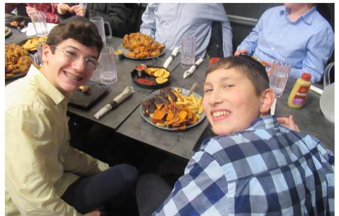
A well deserved night out to all 8th graders who learned over vacation & earned this treat