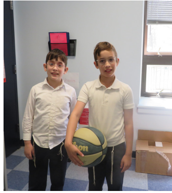
Thank you to the YK Nshei for sponsoring the Rosh Chodesh prizes for this month!