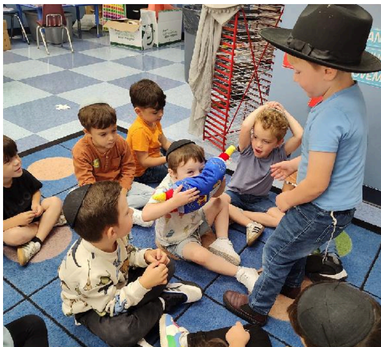
Special chazan time in K2