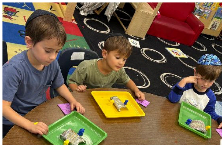
Pre1a learning position words