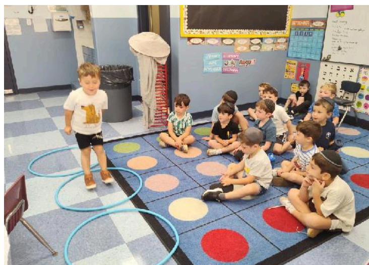
K2 pretending to be jumping "אייל" while we learned where shofars come from.