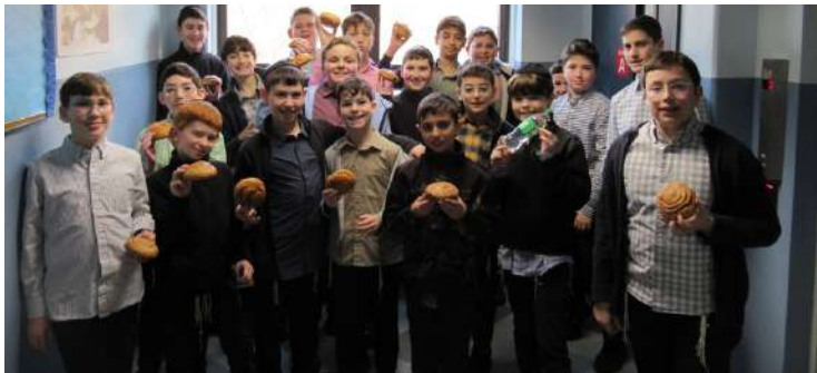
Mishna Yomi Siyum on Maseches Chullin, Mazel Tov!