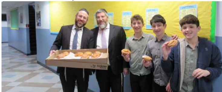
Kabbalah To Join Mishna Yomi