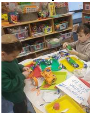
Wrapping presents for Eisav