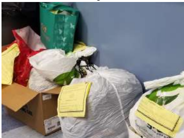
Malbish Arumim—what a chesed, as so much clothing was donated to Kupas Ezra to help those in need.