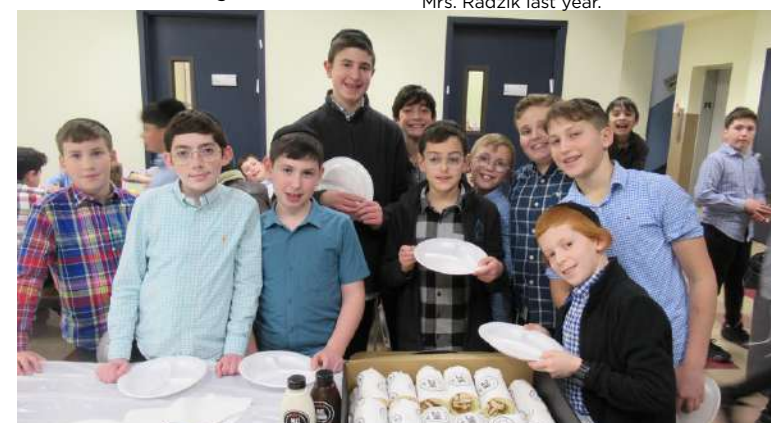
Mishnayos Chaburah Siyum on Maseches Gittin. Chaburah Learns 10 minute before Shachris daily.