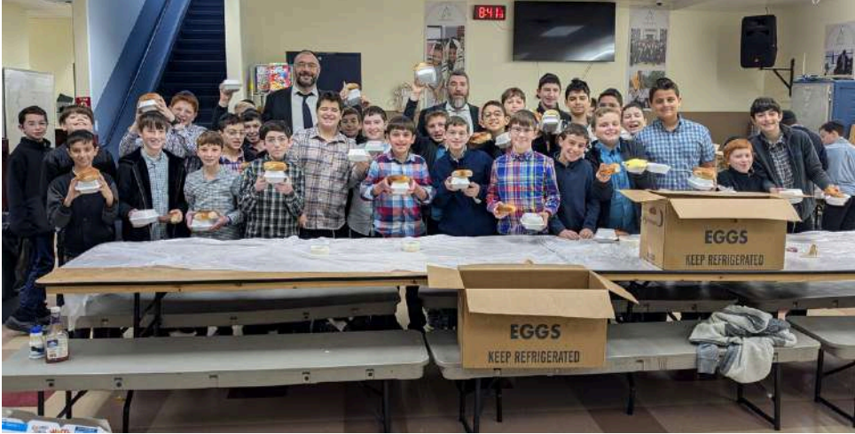
Kedusha Warriors members rewarded with a breakfast special