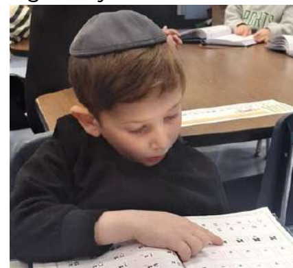
Super pointing in Pre1a!