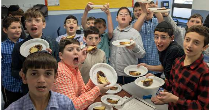
Mazal tov to the 7th grade for reaching the second Mishna in Hakones; almost 5 Blatt in!