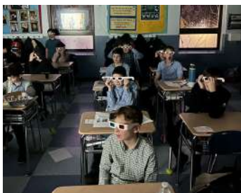
6th Graders Exploring Egypt in 3D!