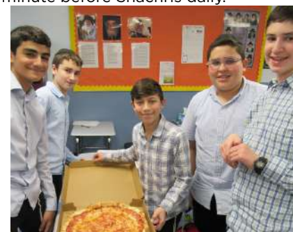
Winners of the Great Clickers Challenge