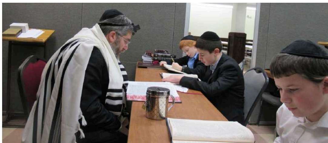
Early morning Gemara Chabura nearing its completion of Maseches Beitza