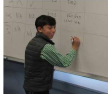
8th graders mastering the sugya of mikva