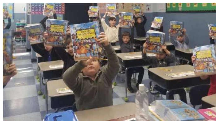
1 st graders getting ready to learn Chumash with their Bright Beginnings workbook.