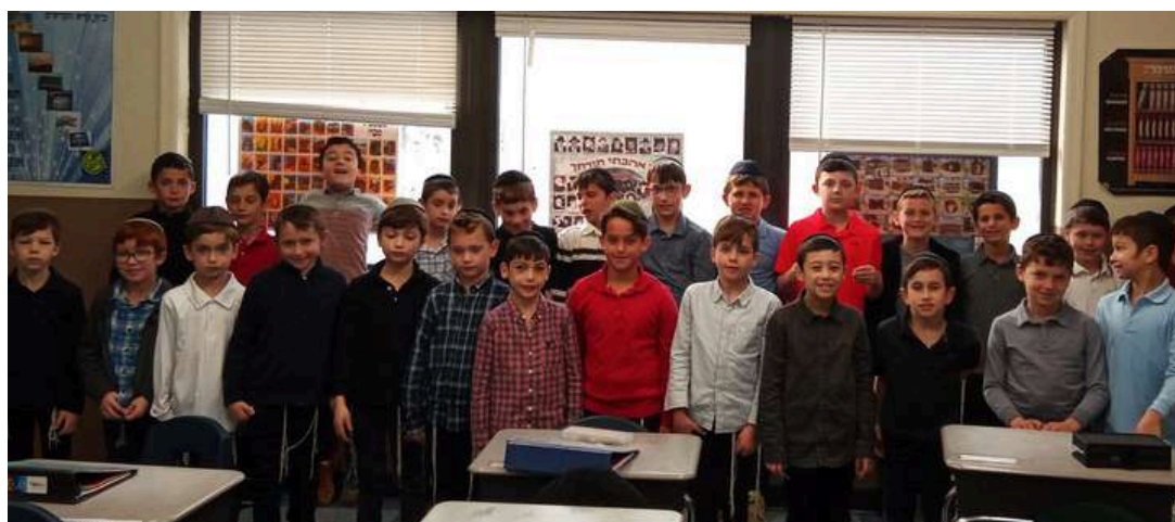
Practice for Hascholas Mishnayos Production this Sunday

YKOR students love to read! Help keep their minds growing – donate a new or used book to our School Library!