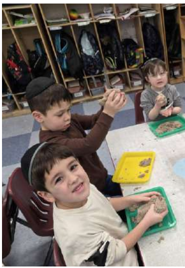
Letter K sensory fun in K2