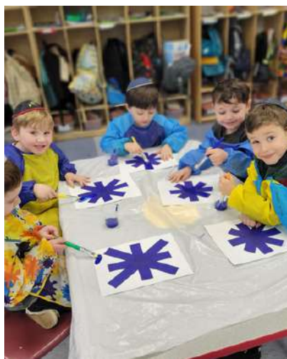
Winter Painting in K-2