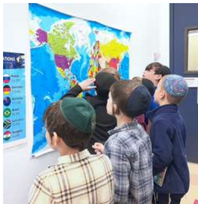
2 nd graders looking at the map in the library