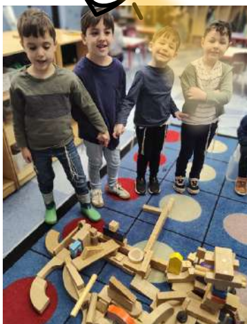
Playtime in K-2