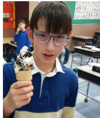
רב רחוב'ס 3 rd גרדרס האבנג א סייום אויבן ישיב