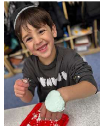
Slime for letter S in K2