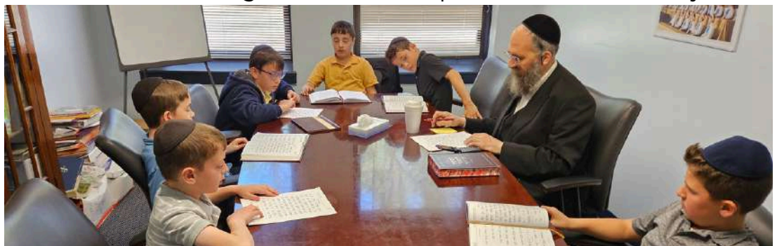
The Menahel testing 3rd grade kriah