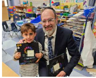
Winners of the light up frisbees