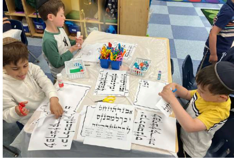
K1 learning the sled Bais like a Sofer