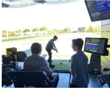
8th Grade Davening Program Reward