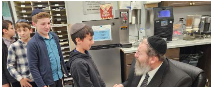
6 th grade boys meet the Mashgiach Shlita