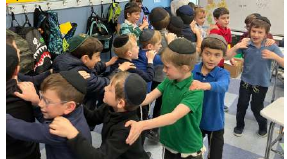
Mazal Tov to the 2nd grade on the completion of Parshas Chaya Sara