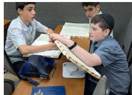
Seventh graders preparing tests on a major Sugyah in Hachovel