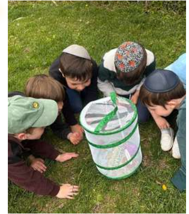
Saying goodbye to our butterflies in K2!