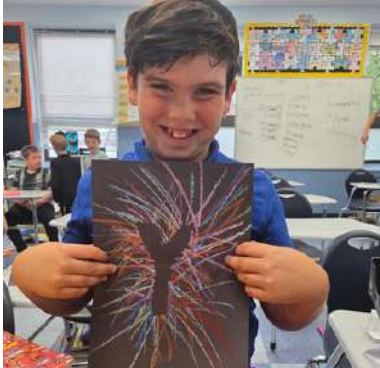
2 nd grade art