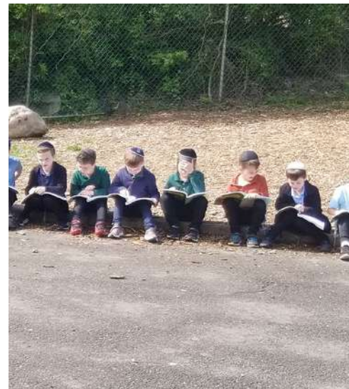
Learning the posuk ויוצא אותו החוצה outside