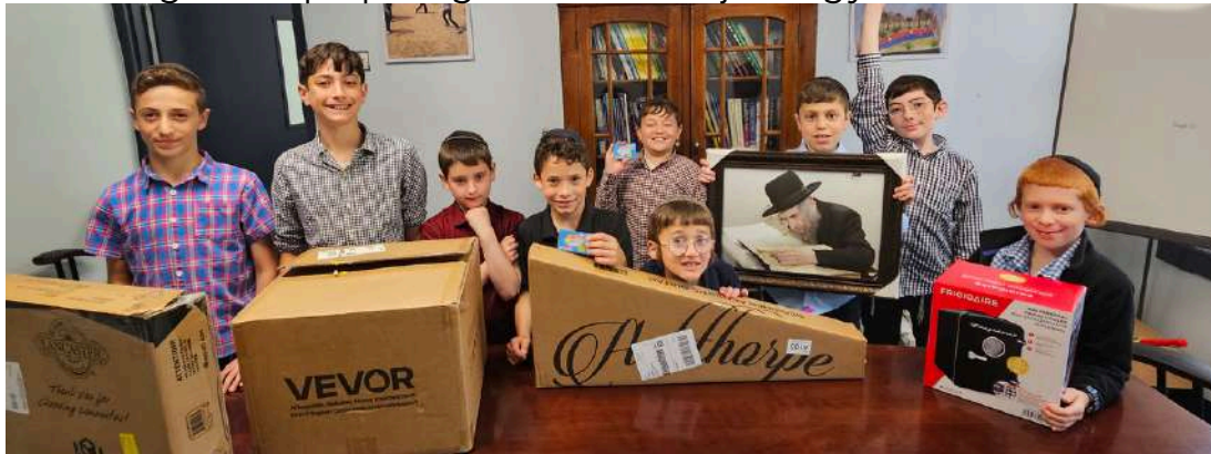
Grand Raffle Winners of the Pesach Hasmadah Challenge