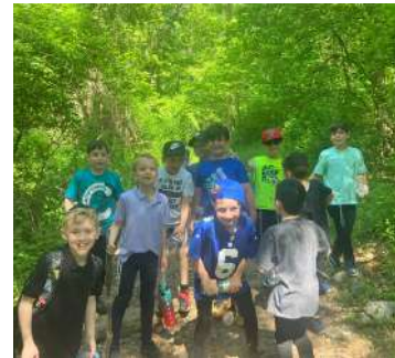
2 nd Grade talmidim enjoy a beautiful hike in honor of being mesayem Parshas Chayei Sarah