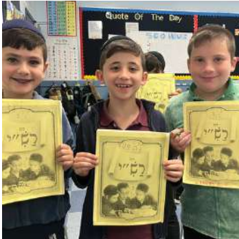
2 nd graders holding their completed Rashi booklets