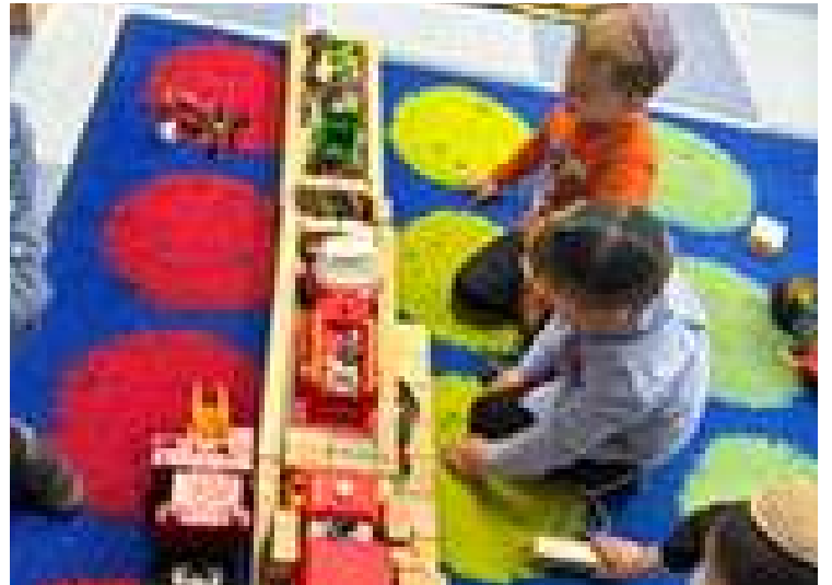
Nursery at playtime