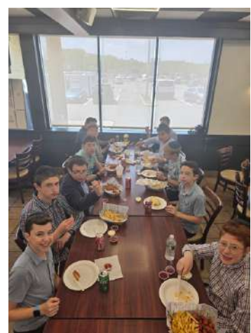
8 th graders getting rewarded for collecting over 7k on Purim