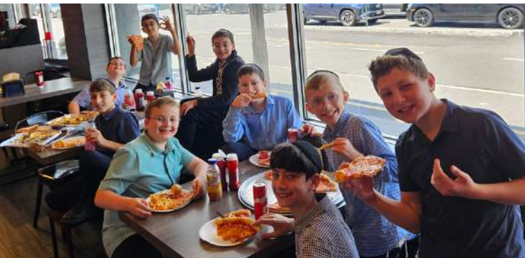
6 th grade on bowling trip as a reward for beautiful Davening