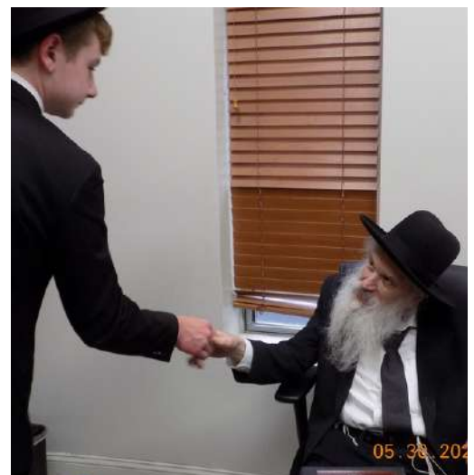
9 th Grade Shiur trip to BMG in Lakewood