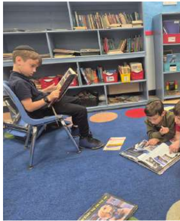
Library time for 2 nd grade