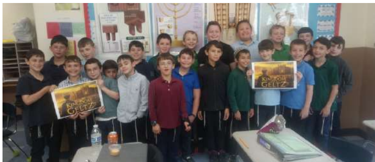
4 th graders holding RCP signs