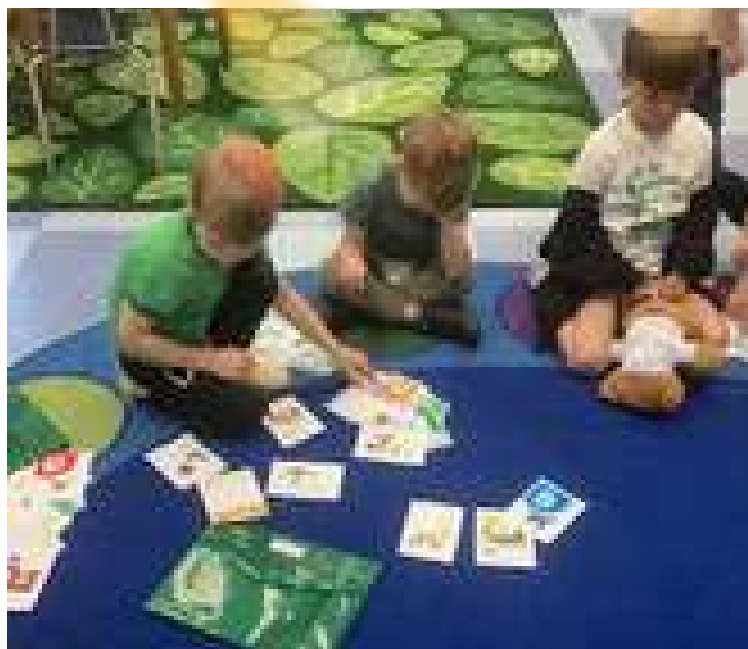
K-1 Alef- Bais card collection