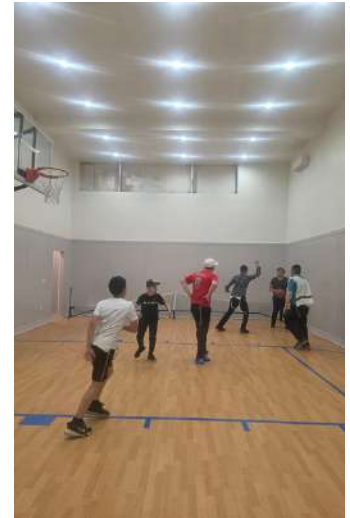
8 th grade raffle reward trip for collecting almost $18,000