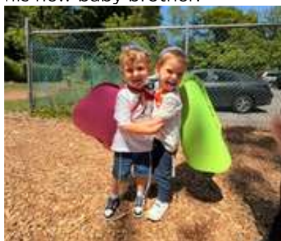
Nursery's butterfly art 'n crafts