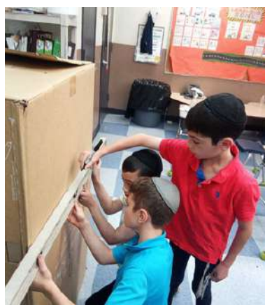
3rd grade reviewing Mesechta Sukkah by building a sukkah in the classroom